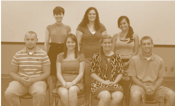
2011 Carroll County Reception